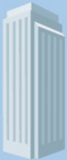
Multi Tenant Office Towers