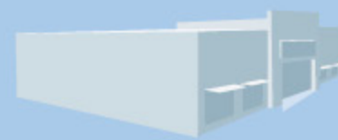
Retail Outlets and Shopping Malls