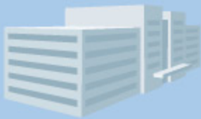
Institutional and Healthcare Facilities