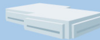
Manufacturing Facilities and Warehouses