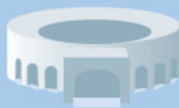
Sports and Entertainment Facilities