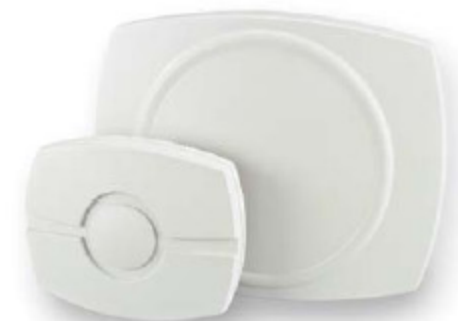
SpotCell® Indoor Coverage System

Our products are carrier-specific to ensure the best signal integrity, supporting CDMA, GSM and iDEN technologies and all carriers operating in North America. Once installed, our SpotCell systems require no maintenance or adjustments and are guaranteed to maintain signal integrity under a broad range of conditions.